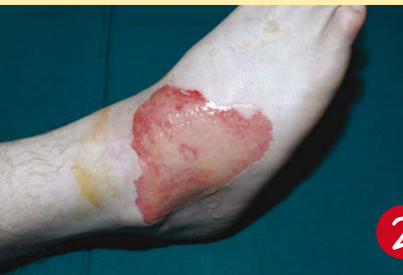
burn with blisters and start of Flaminal® Forte use + tulle gras/gauze dressing and dry sterile dressing