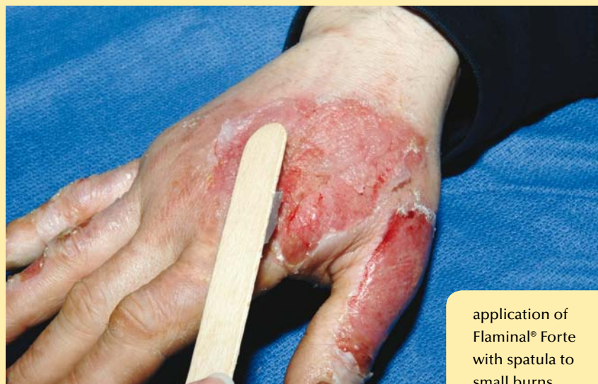
application of Flaminal® Forte with spatula to small burns