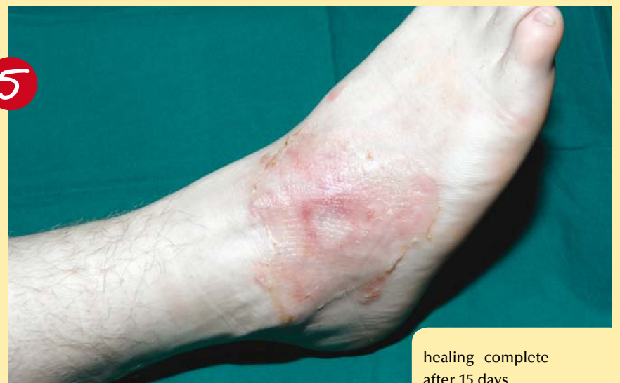
healing complete after 15 days